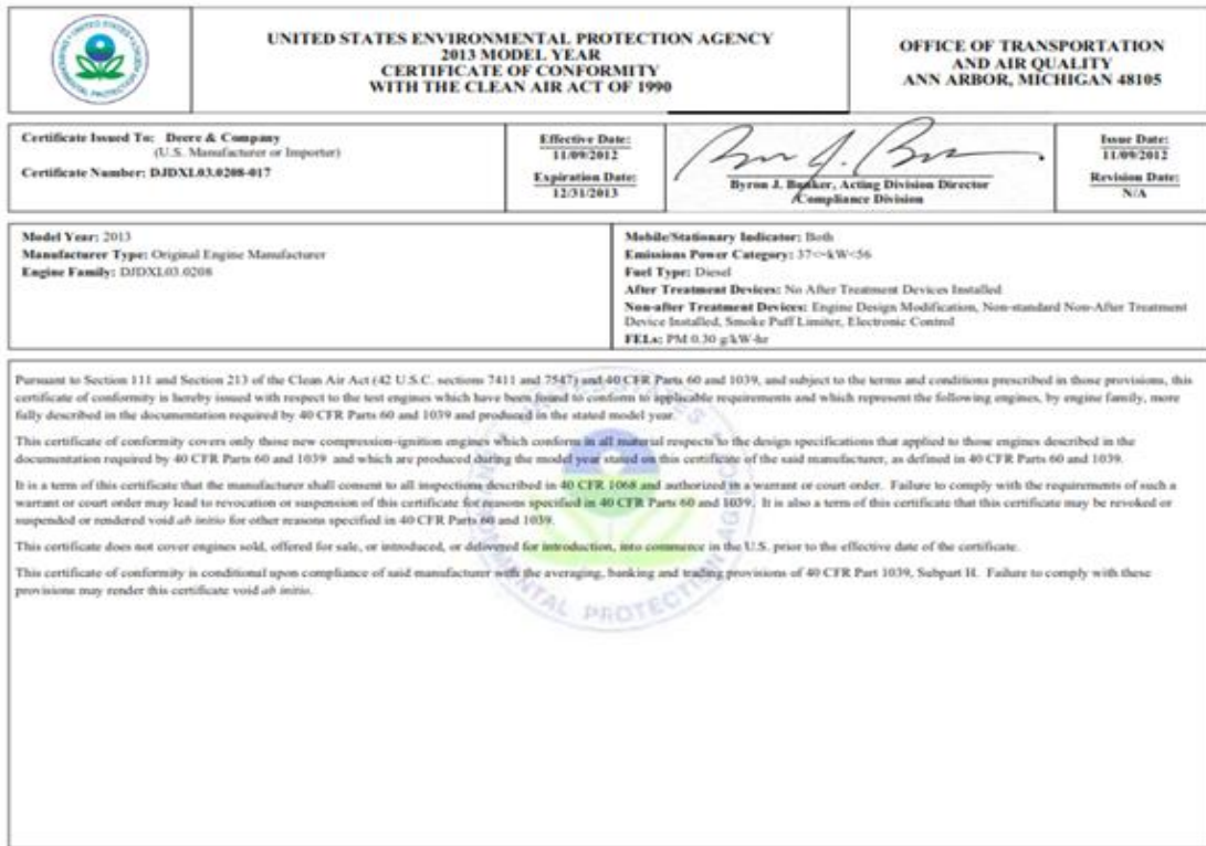
Figure 2-1 Example Certificate of Conformity

The engine records should include the Certificate of Conformity for the engine. An example of a Certificate of Conformity is depicted below: